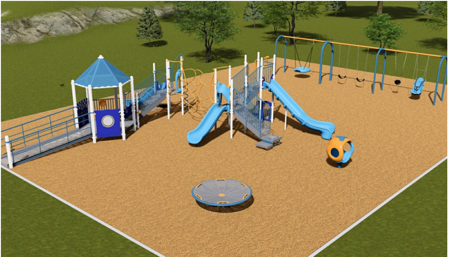
Picture of the Playground equipment design to be installed at Jerry Park